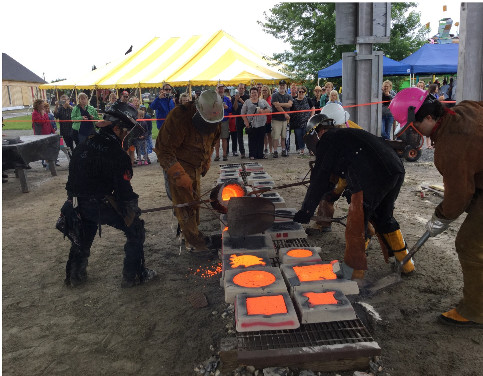
2019 Community Collaboration Hot Metal Pour