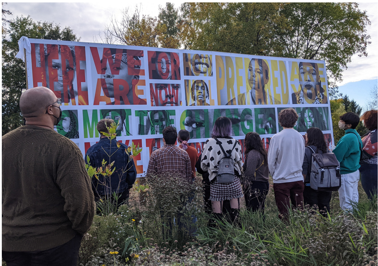
Visitors gather at Franconia's 25th Anniversary for the unveiling of the FSP Billboard Project