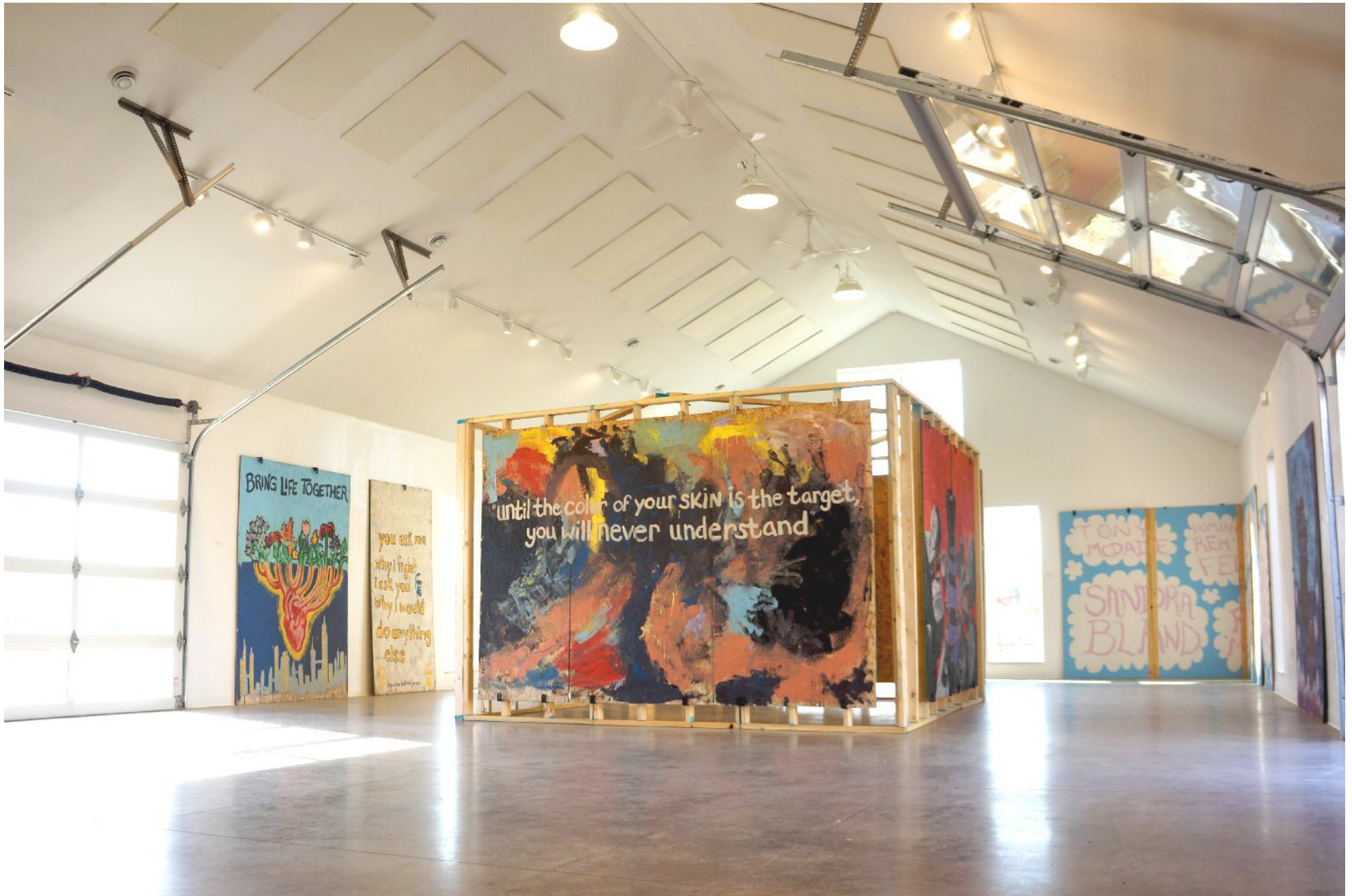
Exhibition of selected murals from Memorialize the Movement displayed in the Driscoll Education Center